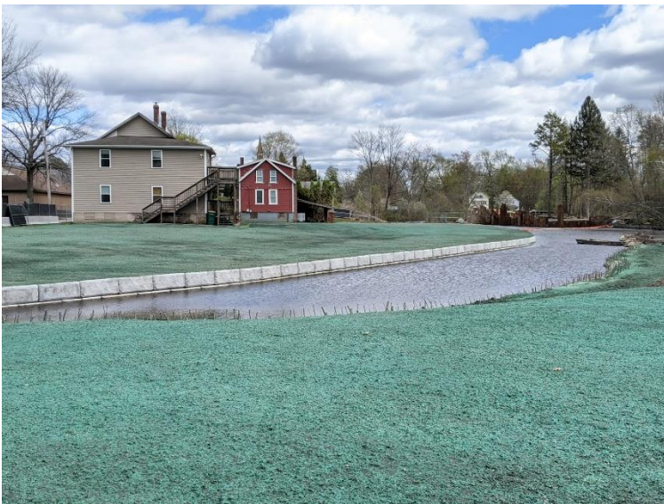
Restoration and Stabilization of Mire Brook