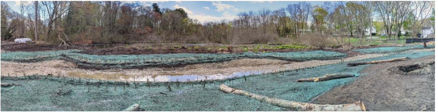
Restoration (Hydroseeding) of Area 4