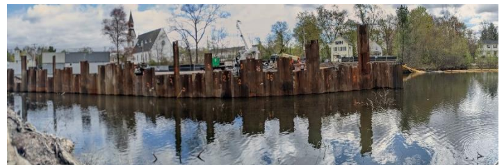
Wetland Excavation (top) and Cofferdam Installation (bottom)